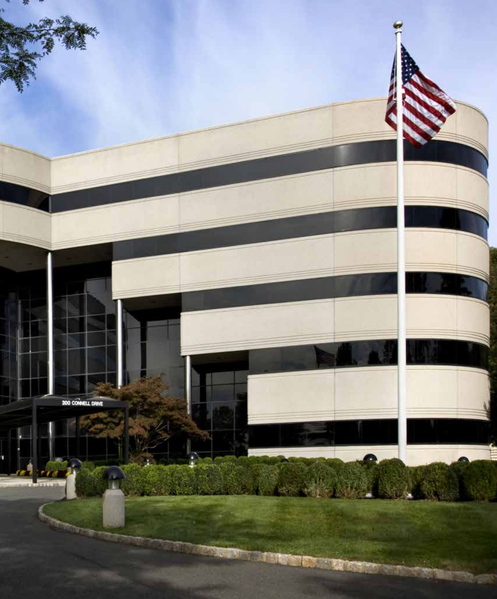
The Connell Company Headquarters 200 Connell Drive, Berkeley Heights, NJ